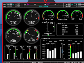
Glass Control Panel One Button Start, Self-Diagnostics, Telemetry Ready