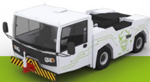
»BISON« E 370

75 kW | 105 kN | MTOW ≤ 125 t 70 kWh | 105 kWh | 140 kWh