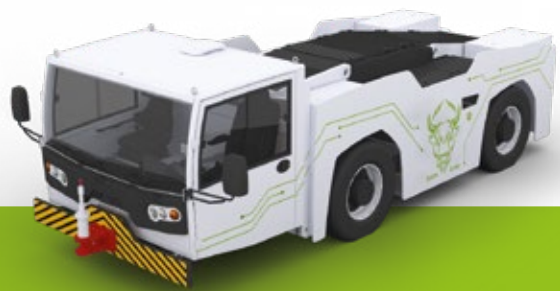
»BISON« E 620

75 kW | 105 kN | MTOW ≤ 125 t 70 kWh | 105 kWh | 140 kWh