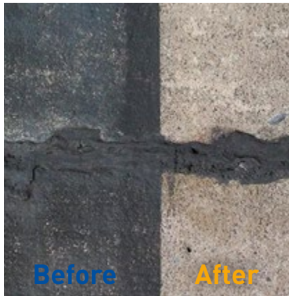
Even the expansion joint material has not been destroyed.