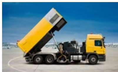
The tank and sound hood can be tilted hydraulically for maintenance purposes and for emptying the waste water tank. This allows easy access to all components – high pressure pump, boost pump, fan, cooler and extractor.