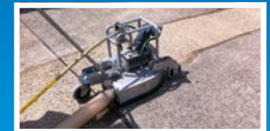
Small inaccessible areas can be handled with the hand cleaner MCD 360.

To ensure that the surface being treated is not damaged, the high-pressure system shuts off the moment the driver steps on the clutch or brake. The high-pressure system can only be activated when the vehicles is actually in motion. Even at full load (2,500 or 3,000 bar